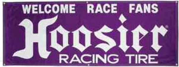
Welcome Race Fans Banner Product #25002 3' x 8' Vinyl banner.....$20.00

Live comfortably with great looking Hoosier gear. Show your style wherever you go: at the track, field, school, work...anywhere!